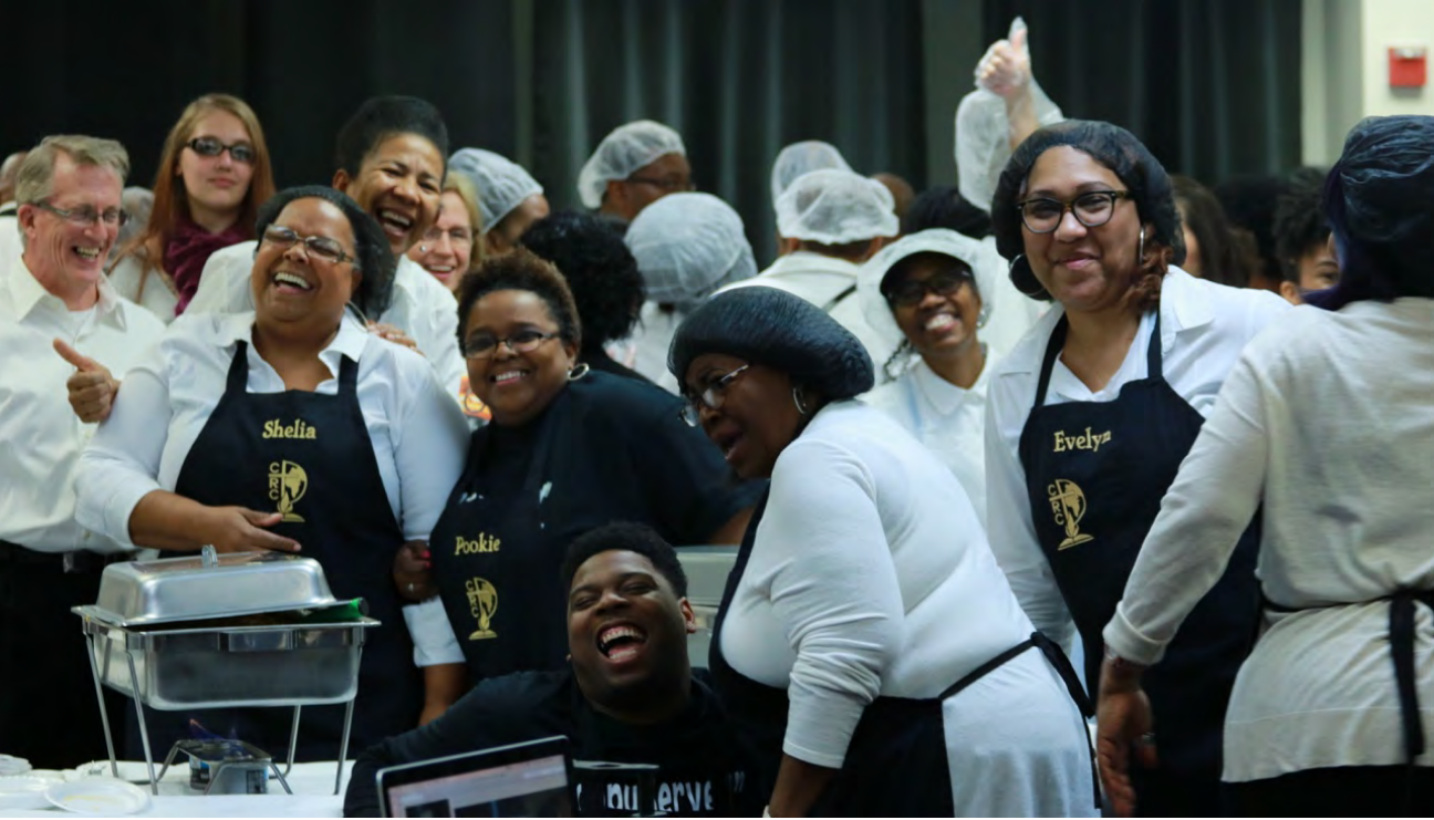
DREAM TEAM MEMBERS