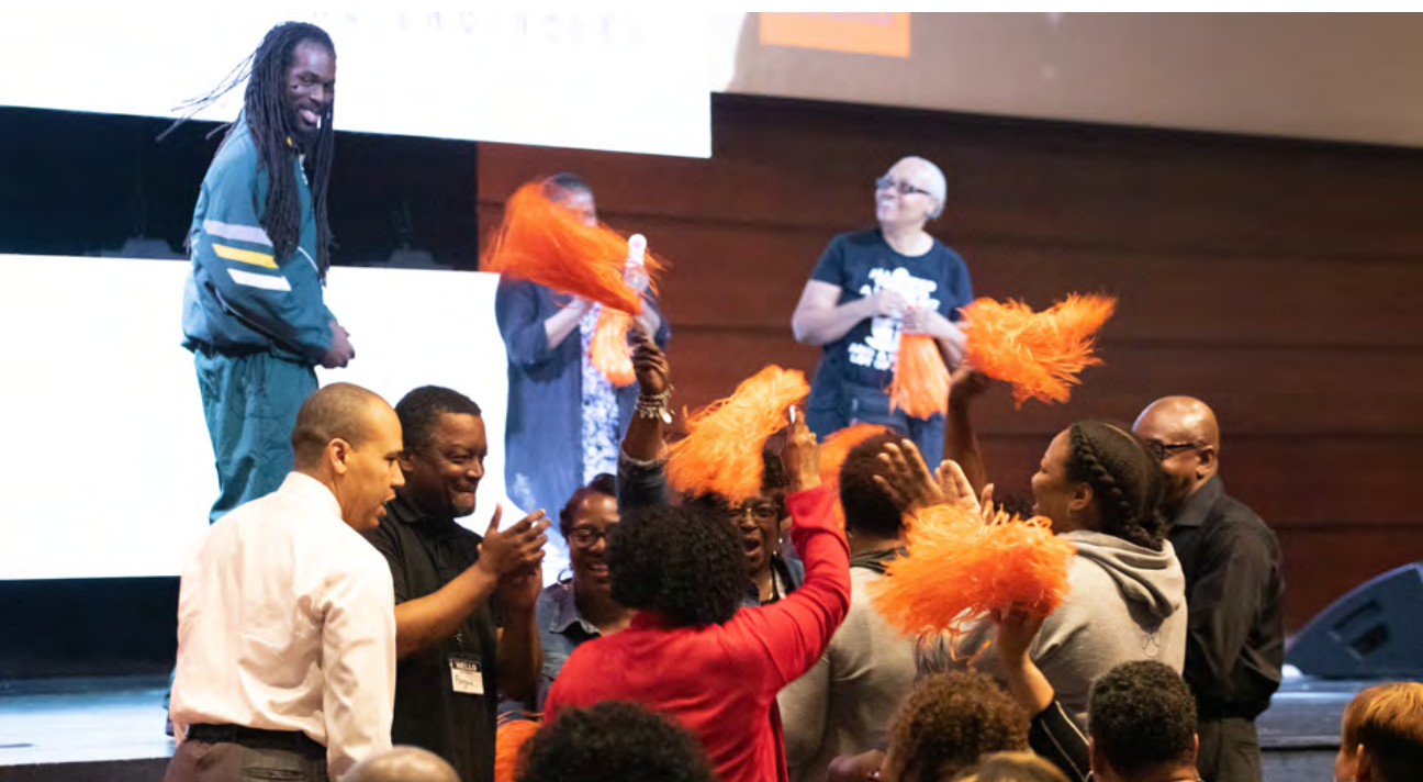
DREAM TEAM RALLY