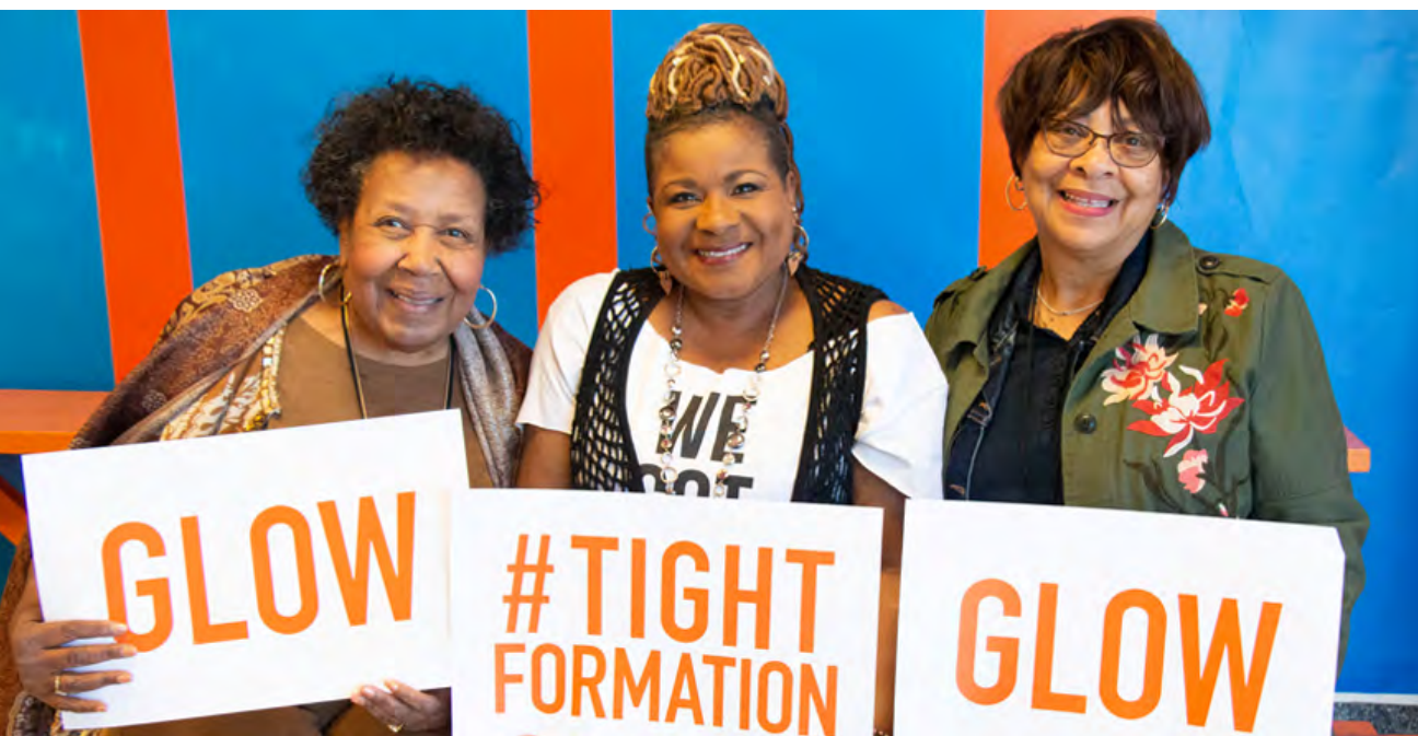
GLOW WOMEN'S CONFERENCE