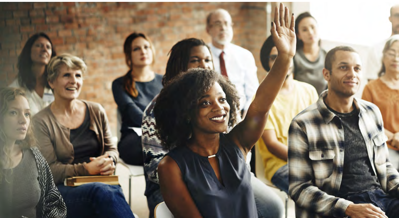
GROWTH TRACK CLASS