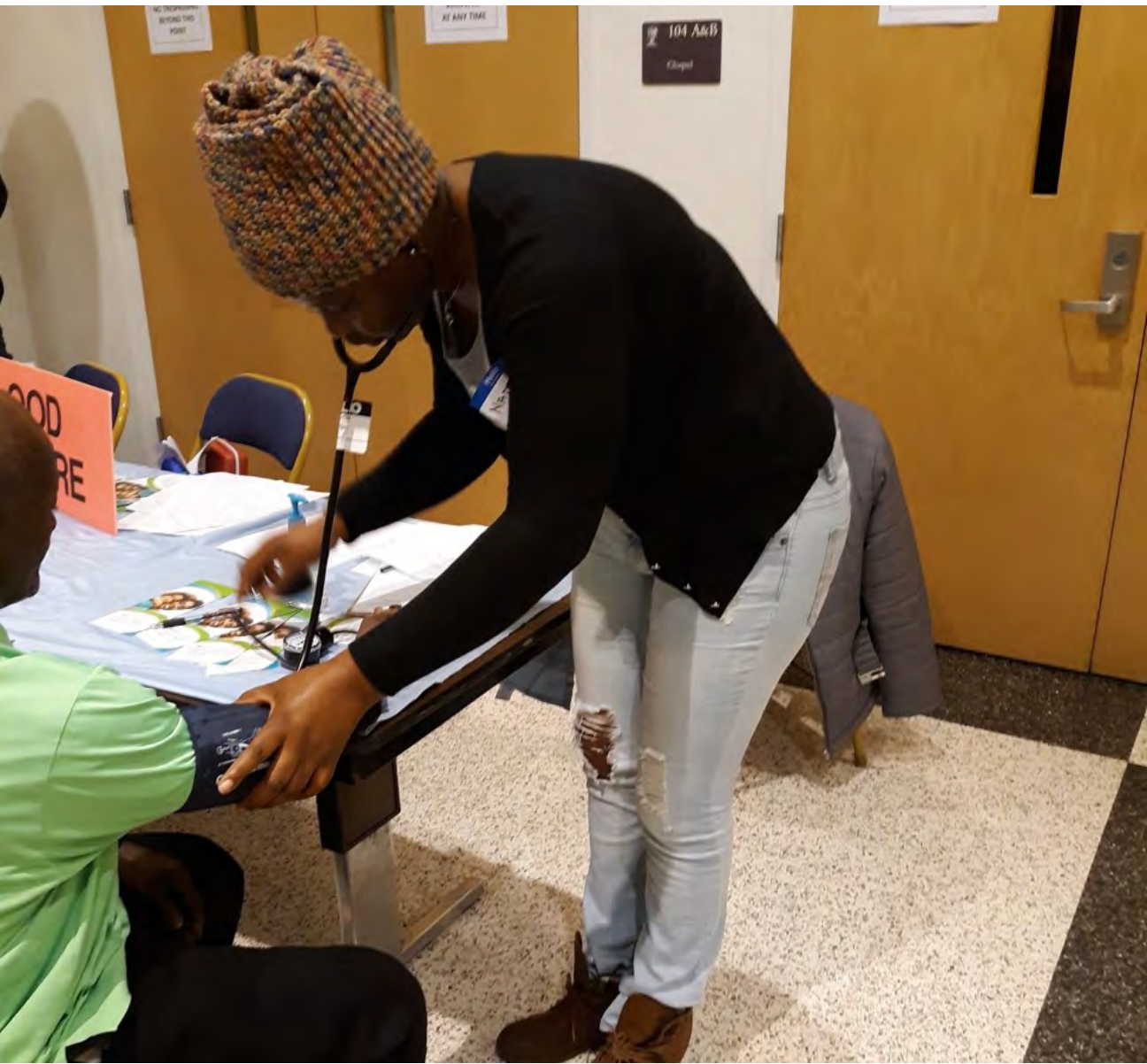
DREAM TEAM MEMBERS