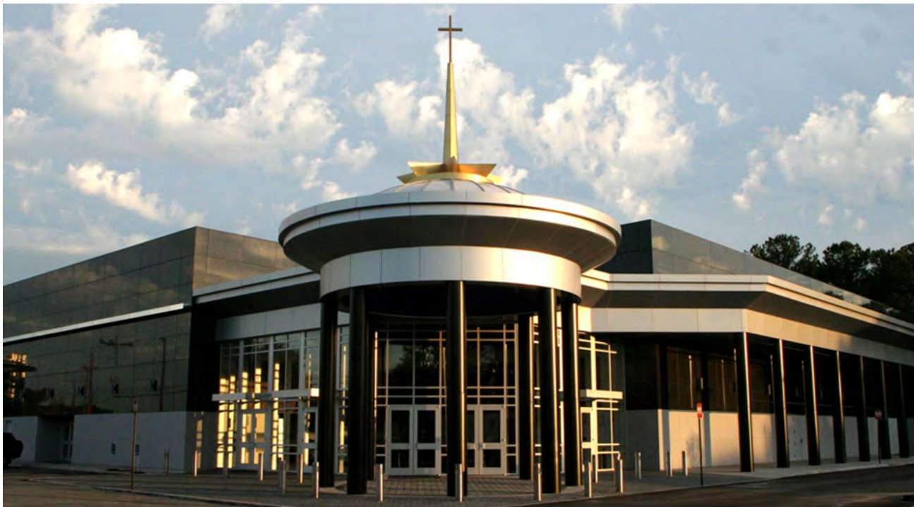
CALVARY REVIVAL CHURCH MAIN CAMPUS